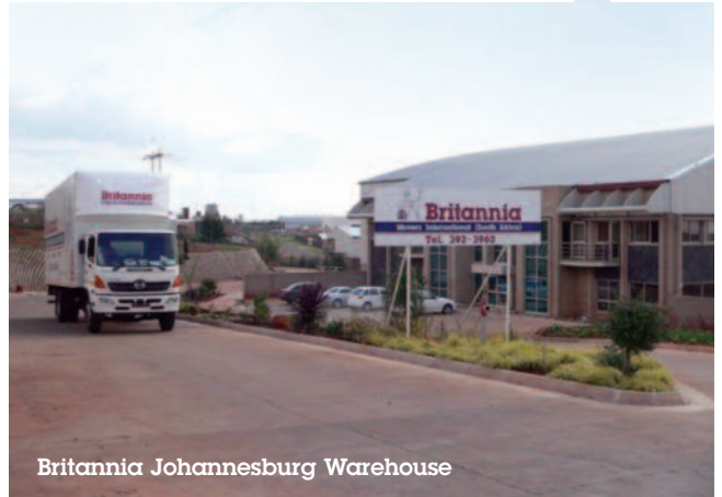
Britannia Johannesburg Warehouse