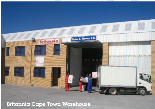
Britannia Cape Town Warehouse

Britannia's two offices provide all the services and standards that customers are used to from Britannia in the UK. Both Britannia Aidan K in Cape Town and Britannia Brytons in Johannesburg are family run operations, thus reflecting the Britannia Movers set up back in the UK. Apart from the obvious advantages of using Britannia throughout your move to or from South Africa; our offices can provide you with useful destination information regards your new surroundings and are always on hand to offer advice and guidance to help you acclimatise as soon as possible.